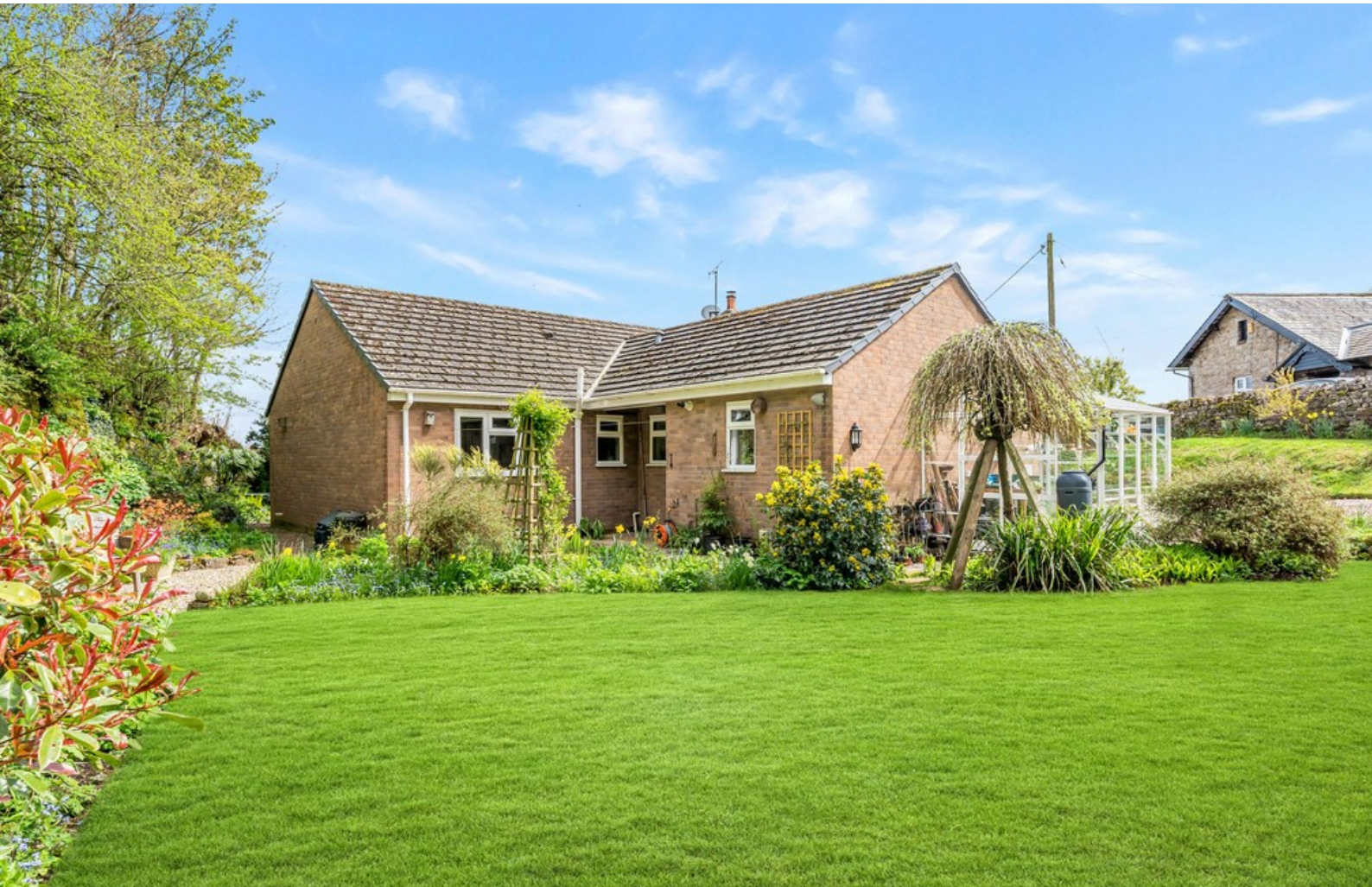
Rear Elevation and Garden