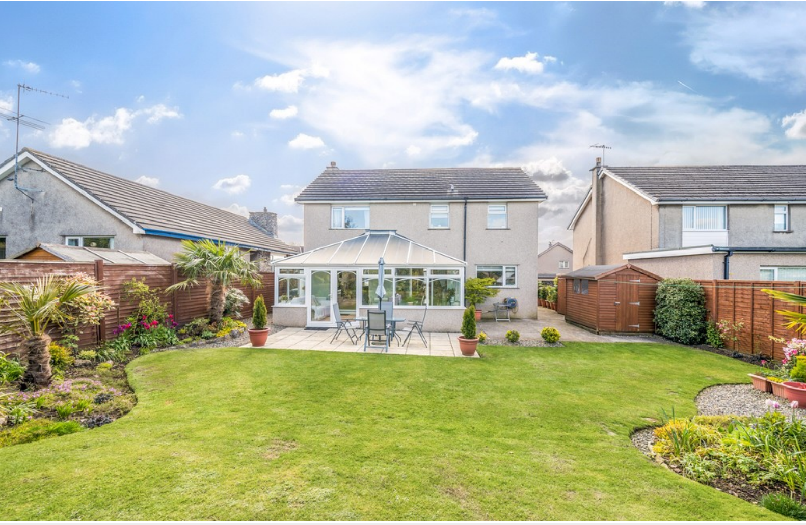
Rear Aspect & Garden