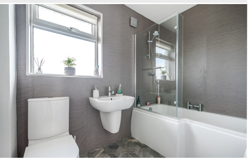
Modern Family Bathroom

Upstairs, the landing is spacious and includes an airing cupboard with a radiator with wooden shelves for linen. Bedroom one is a large double with a delightful outlook over the rooftops to the front and side. A connecting door leads to the fourth bedroom or perhaps it could be utilised as a dressing room for a new owner. The en-suite shower room with tiled walls and vinyl flooring. A three piece suite comprises; a walk-in shower, vanity wash basin and W.C.