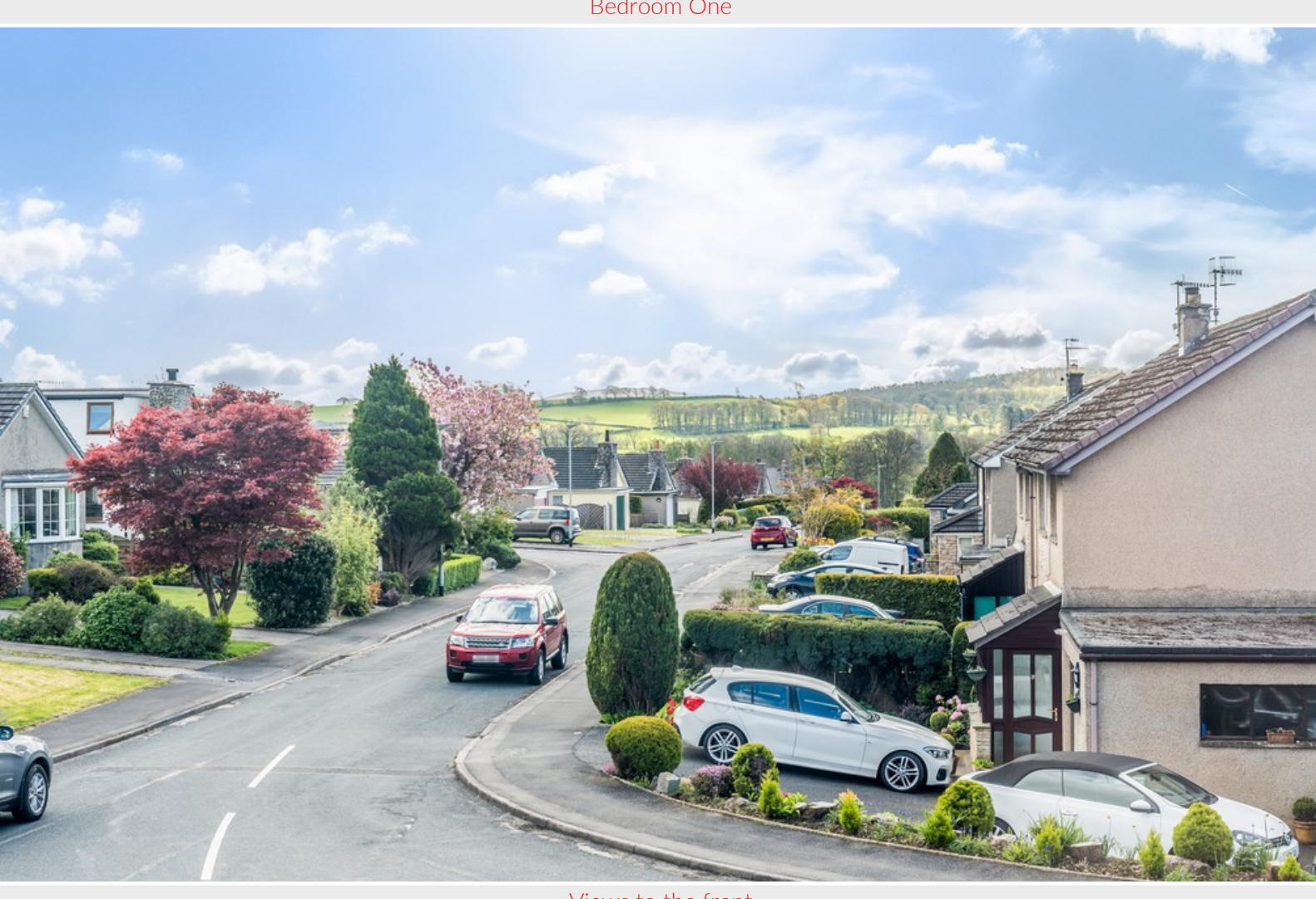
Views to the front