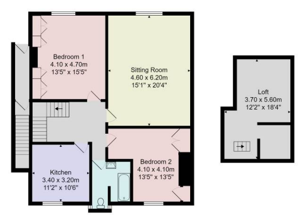
Total Area: 118.3 m² ... 1274 ft² All measurements are approximate and for display purposes only. No liability is accepted by either the agency or Box Property Solutions Ltd as to the exact measurements of the rooms. Box Property Solutions Ltd retains the copyright on this plan and allows agents to use it with agreed permission.