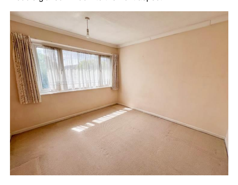
BEDROOM THREE 10' 4" max x 8' 9" max (3.15m x 2.67m)

Double glazed window to the rear aspect. Storage cupboards.