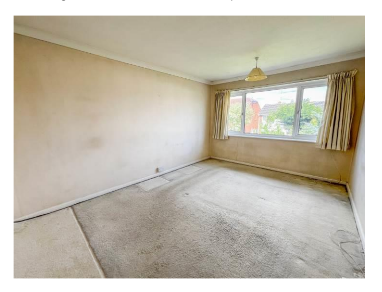
BEDROOM TWO 10' 11" x 10' 5" (3.33m x 3.18m) Double glazed window to the front aspect.

Double glazed window to the rear aspect.