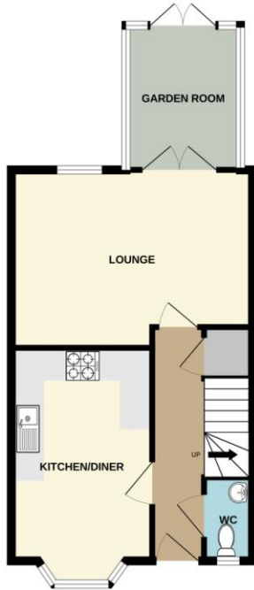
GROUND FLOOR 496 sq.ft. (46.0 sq.m.) approx.