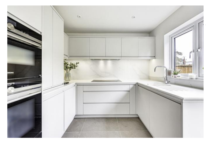
94 Olive Avenue, Leigh-on-Sea, SS9 3QE Offers in the region of £650,000

Essex Countryside are proud to present this stunning threebedroom detached bungalow in Leigh-on-Sea! Offering parking for three vehicles and a beautiful south-facing garden, it's a peaceful retreat. Inside, you'll find comfortable living spaces, including a cozy living room and dining area, and a well-equipped high spec modern kitchen. Step outside to enjoy the privacy of the sunny garden, perfect for outdoor gatherings in the summer or simply soaking up the sun. Conveniently located near amenities, this home offers a relaxed lifestyle on the sought-after "Highlands estate".