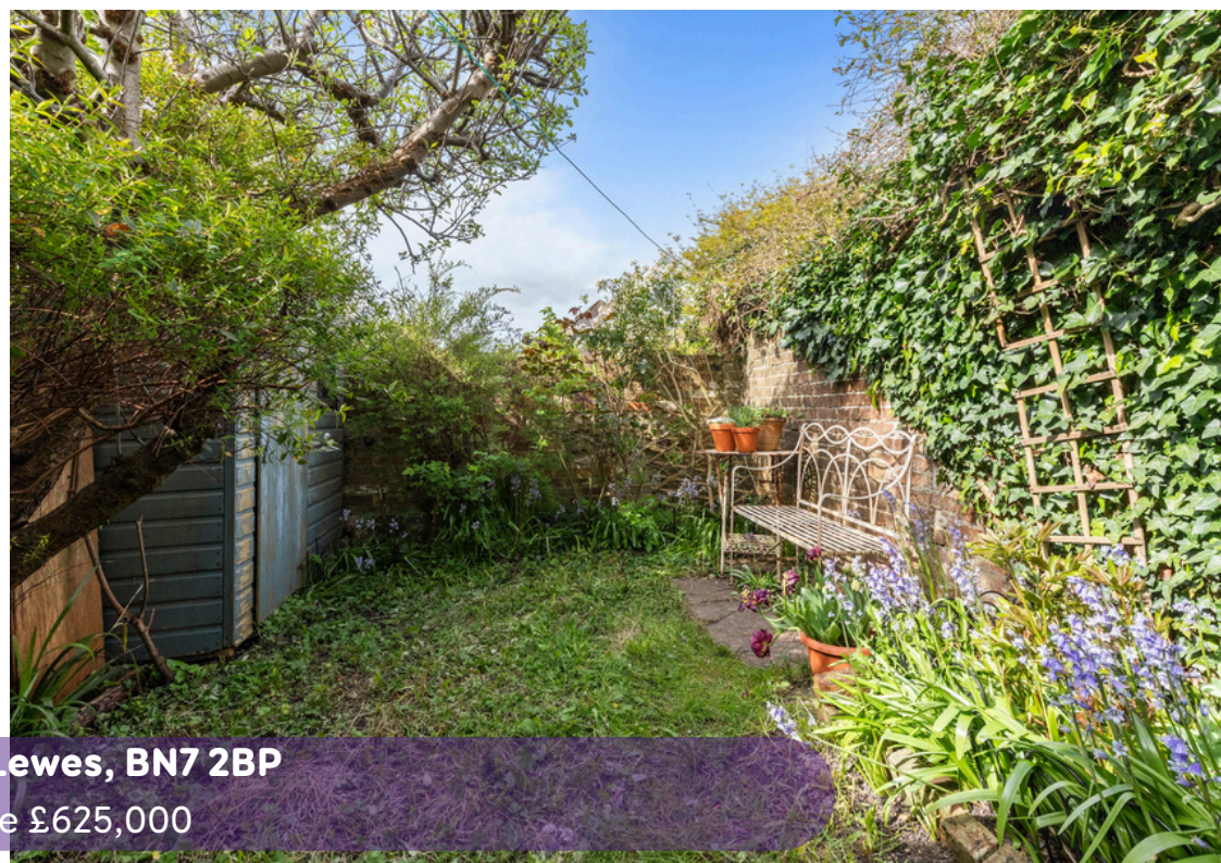
South Street, Lewes, BN7 2BP Asking Price £625,000