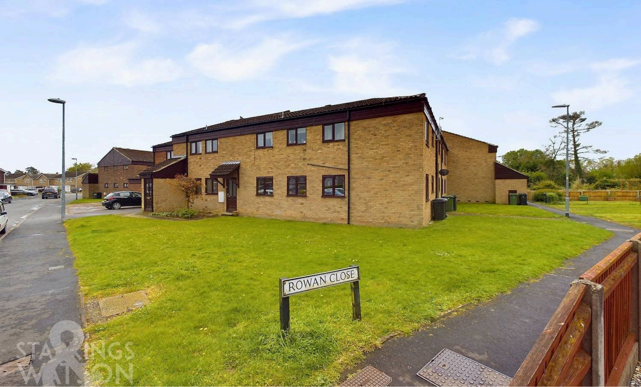
Rowan Close, Wymondham