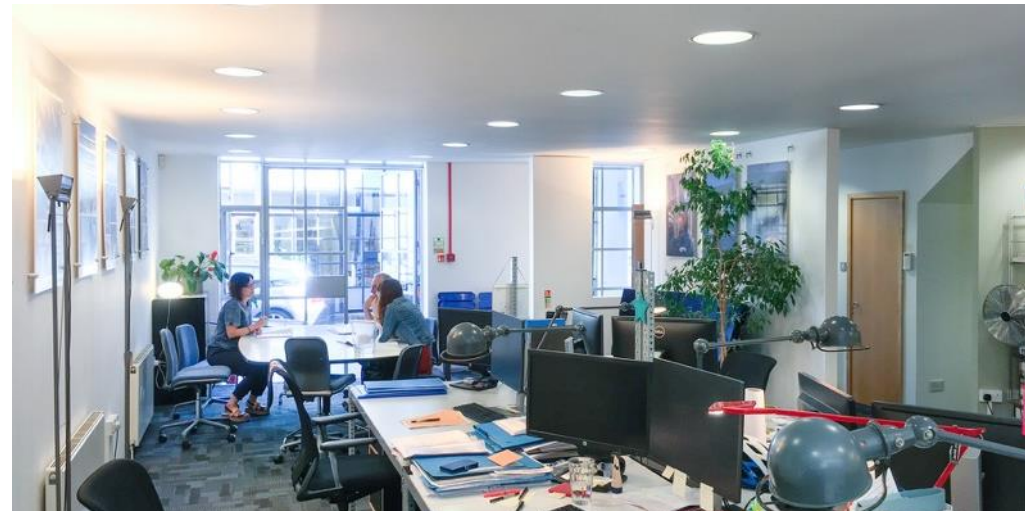
Ground floor office

Misrepresentation Act 1967: These particulars are believed to be correct but their accuracy is not guaranteed and they do not form part of any contract. Unless otherwise stated, all prices and rents are quoted exclusive of VAT (Brochure date July 2019)