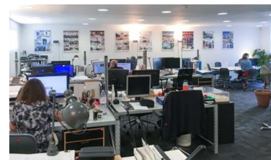
Ground floor office