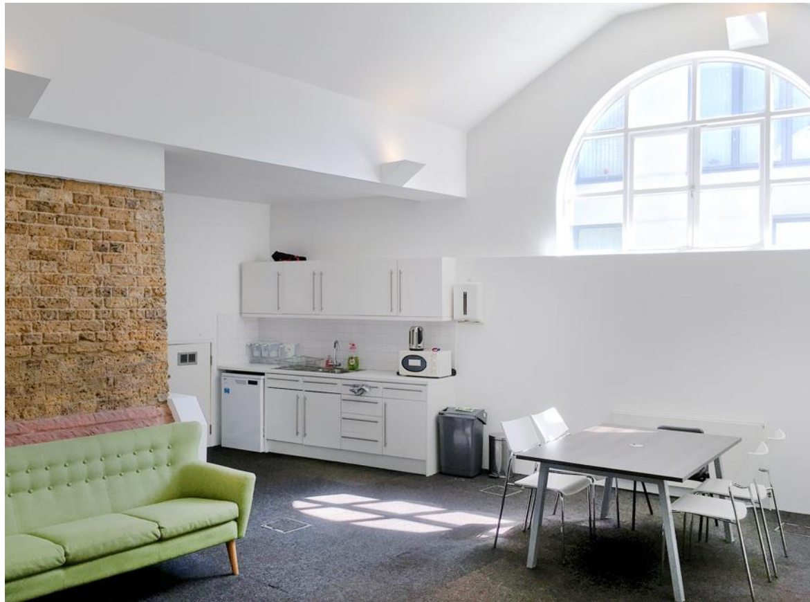
First floor office kitchen