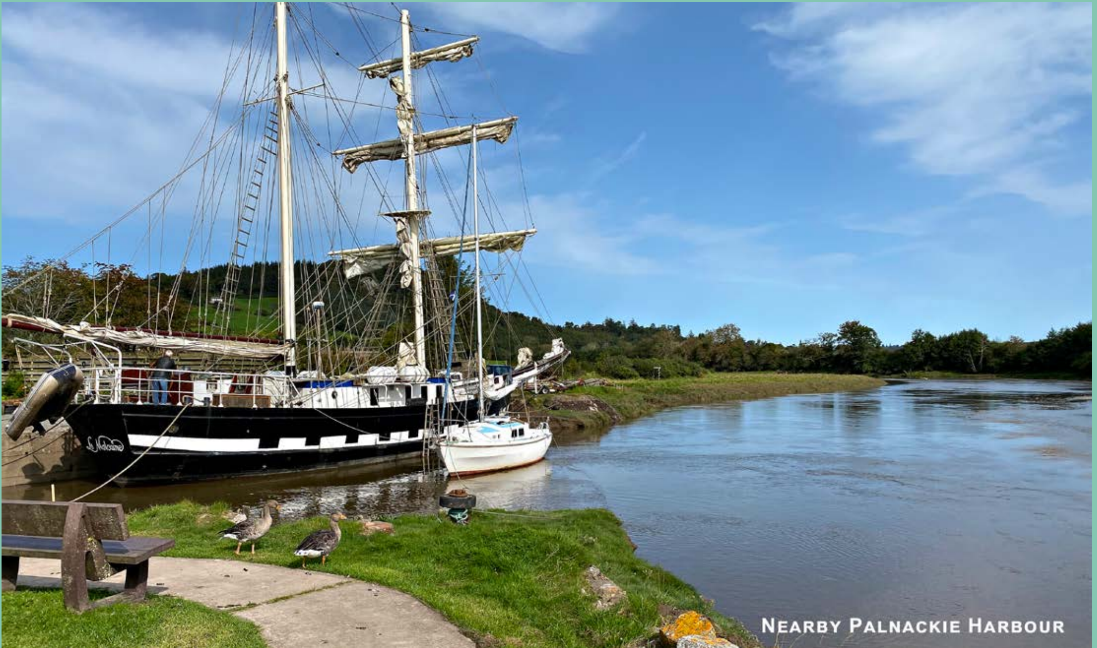
NEARBY PALNACKIE HARBOUR