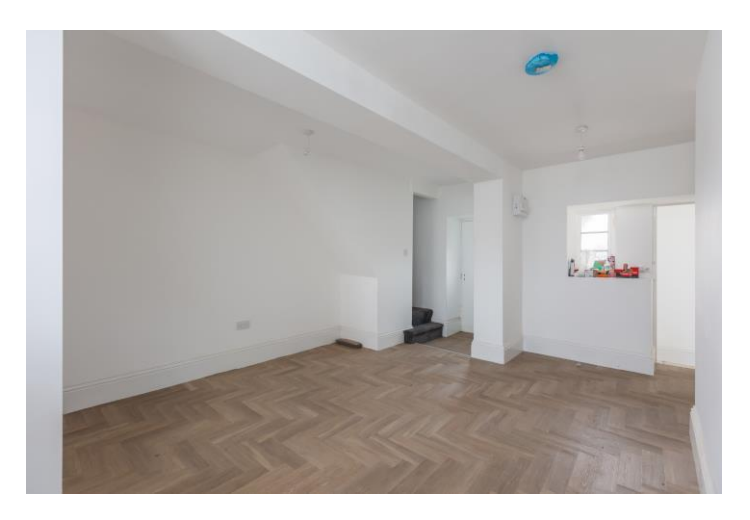
BEDROOM FIVE 5.00 m (16'5") x 3.47 m (11'5") Pair of roof lights. Recessed ceiling lights.

Door from outside. Herringbone LVT flooring. Yorkshire sliding sash window to both sides. Floor standing Trianco oil boiler set within a walk in storage cupboard. Exposed beam. Stairs up to Bedroom Five.