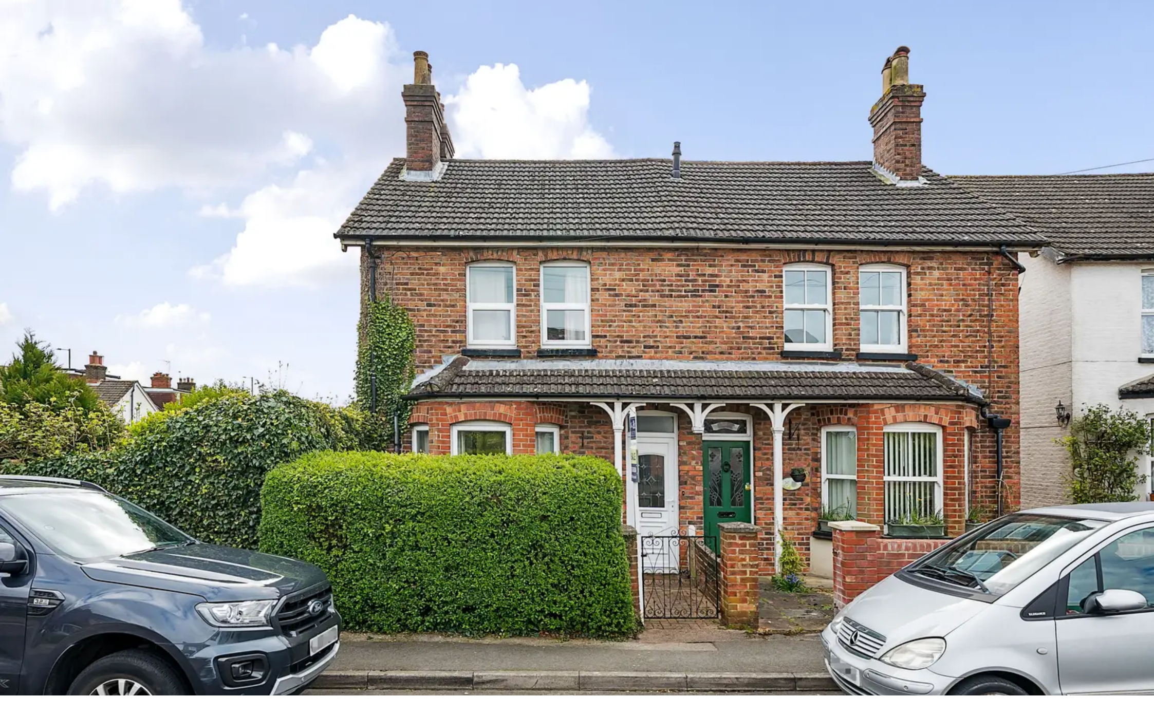
3 Chapel Road, Warlingham - CR6 9LH Guide Price £475,000