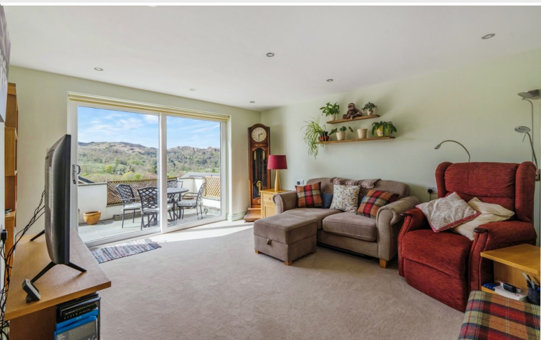
Bedroom 4/ Second Lounge

Location In a fabulous elevated position only a short walk to Ambleside Village and the amenities on offer. From the centre of Ambleside head south onto Lake Road and at the edge of the village centre turn left onto Old Lake Road and then left again onto Low Gale. Continuing up Low Gale take the second turning on your left into High Gale. The property is a short way down on the left hand side.