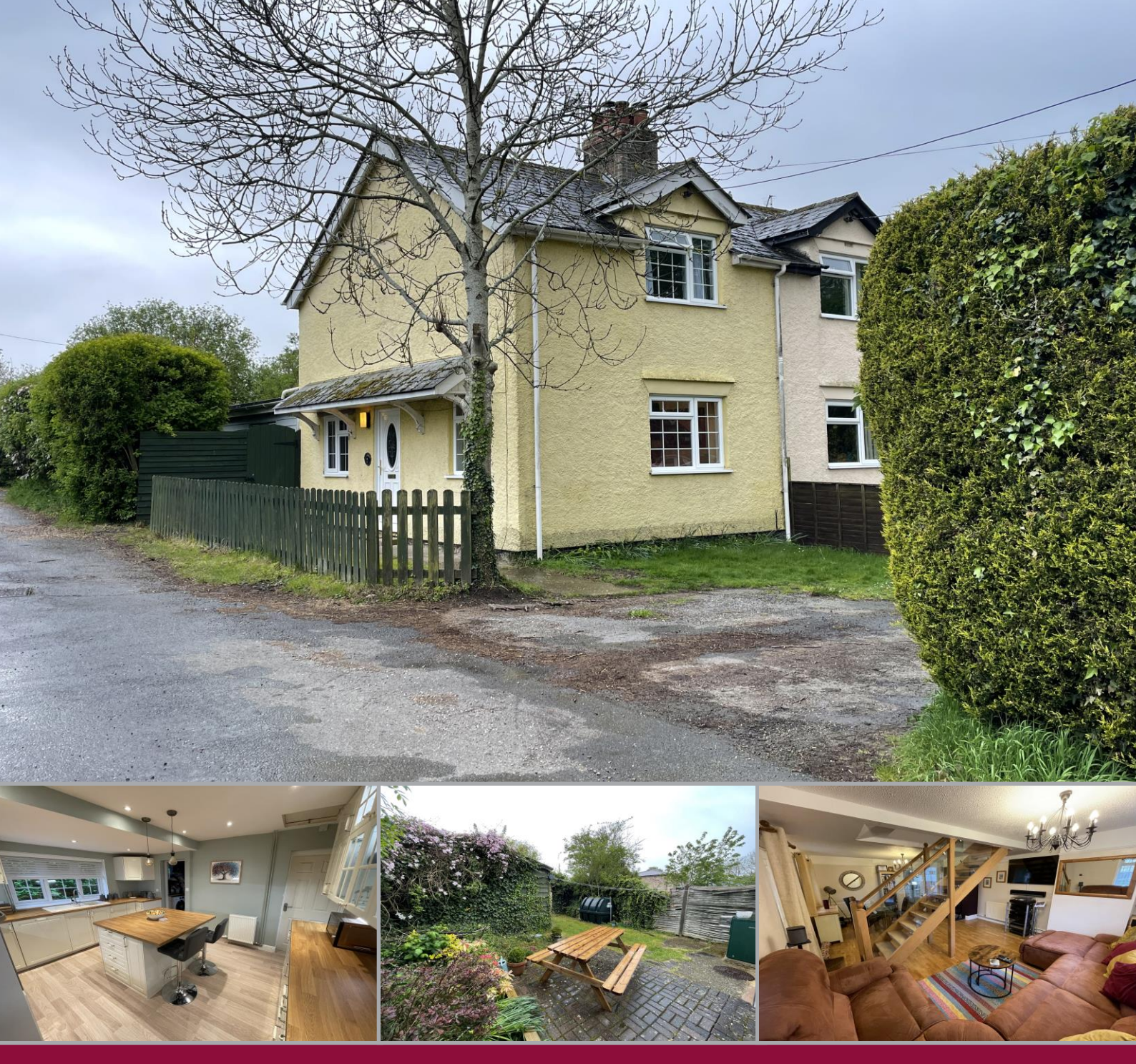
2 Creeting Bottoms | Creeting St Mary | Suffolk | IP6 8PH

Specialist marketing for | Barns | Cottages | Period Properties | Executive Homes | Town Houses | Village Homes