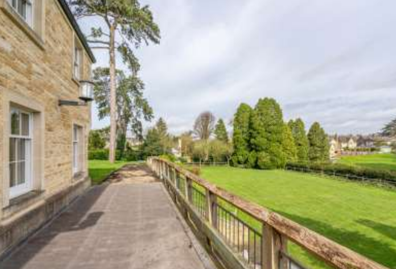
Flat 3, Peter Herve House, Eccles Court, Tetbury, GL8 8EH