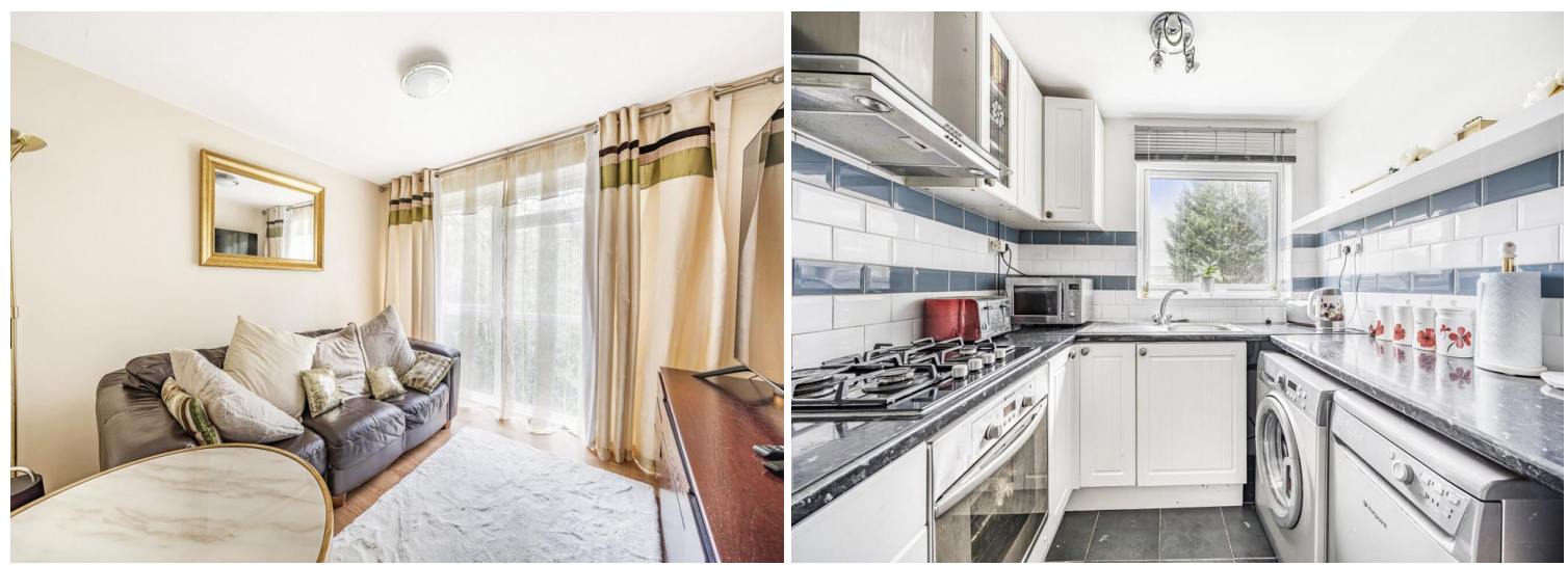
3 Camberley Court, Blackbush Close, Sutton, SM2 6BB | Guide Price £240,000

A superb one bedroom apartment set within a highly sought after well maintained private development, offered to the market with no onward chain and a long lease of 957 years.