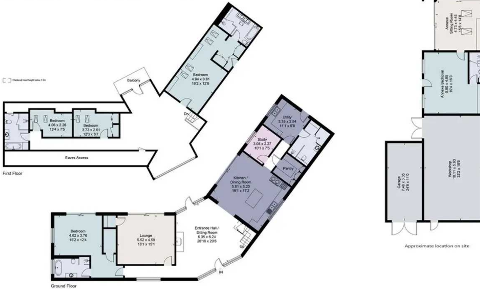
Illustration for identification purposes only, measurements are approximate, not to scale. floorplansUsketch.com © (ID1047438)