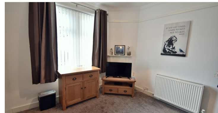
42 Race Road