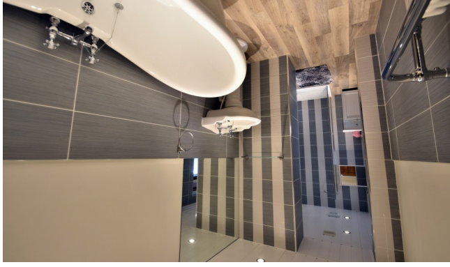
42 Race Road