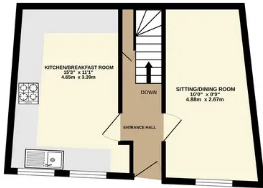
GROUND FLOOR 328 sq.ft. (30.5 sq.m.) approx.