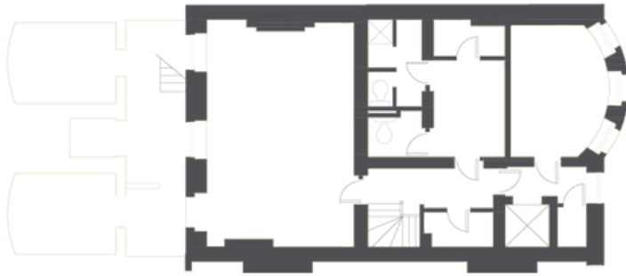
Basement 745 SQFT / 745 SQM