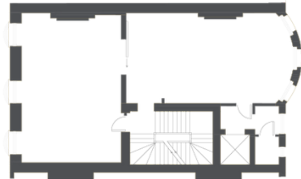
First Floor 893 SQFT / 78,90 SQM