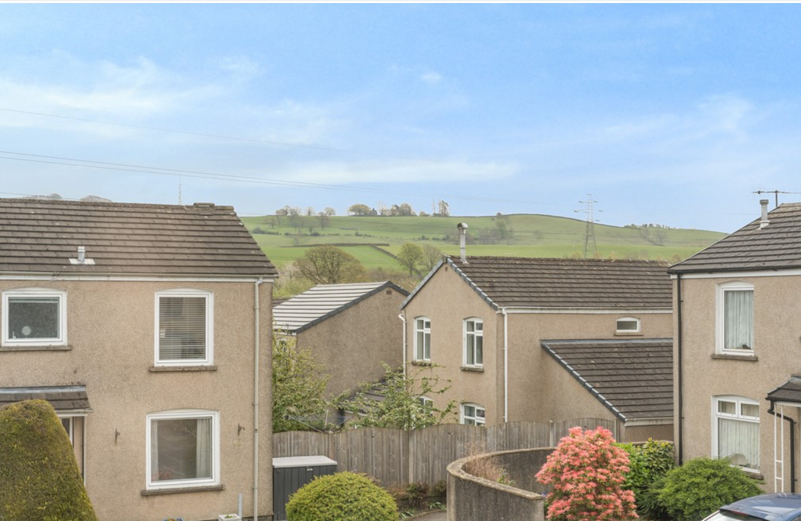
Views to the front