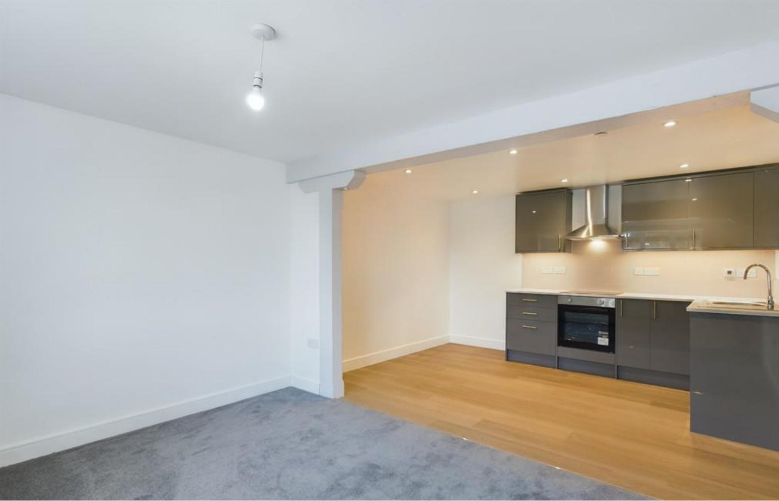
Open Plan Living Kitchen