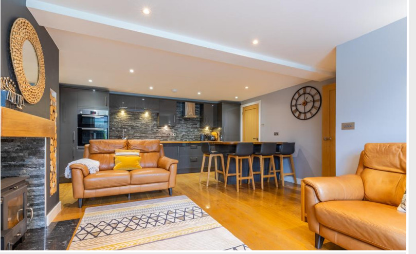
Open Plan Kitchen/Living/Dining Room