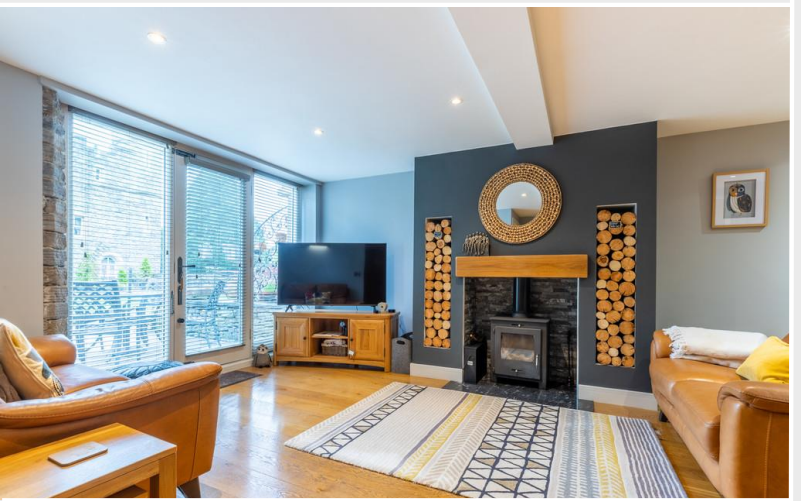
Open Plan Kitchen/Living/Dining Room