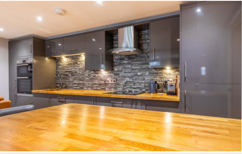
Open Plan Kitchen/Living/Dining Room