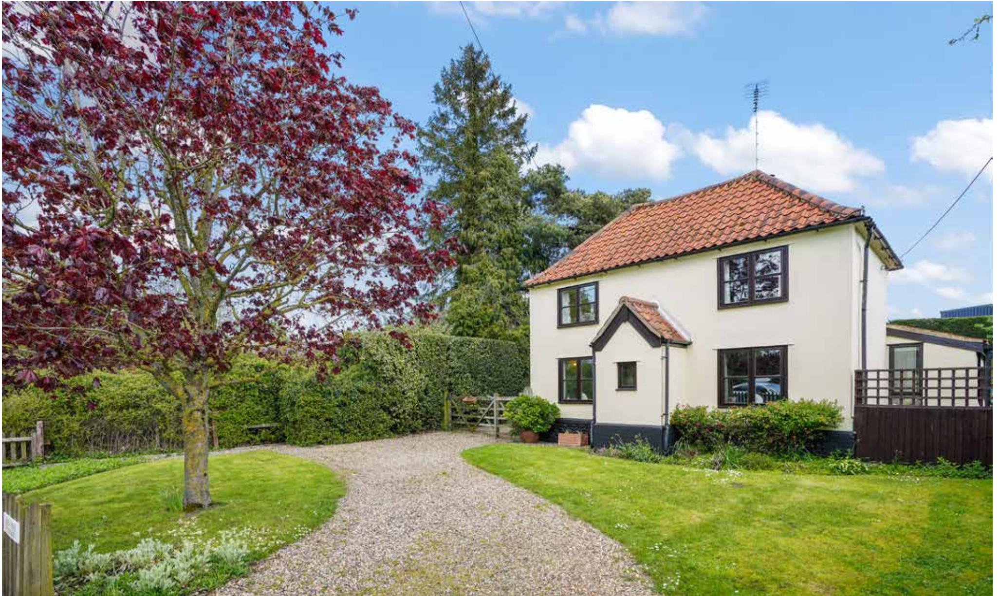
Hall Farm Cottage The Street | Hepworth | Suffolk | IP22 2PS