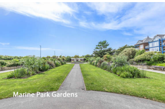
Marine Park Gardens