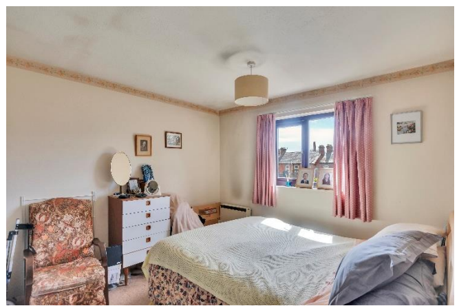
There are two bedrooms one of which is a comfortable sized double .