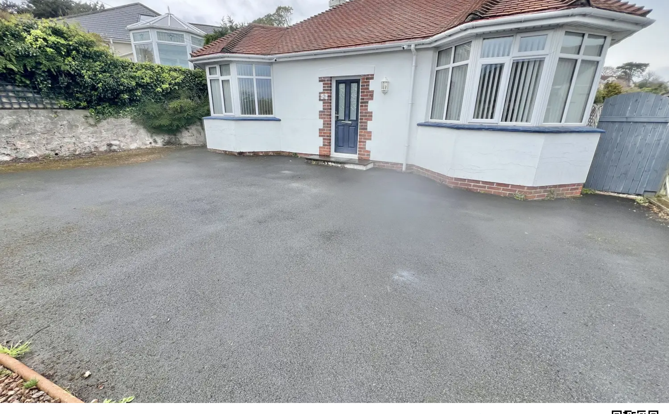
2 Barchington Avenue, Torquay - TQ2 8LB Guide Price £375,000