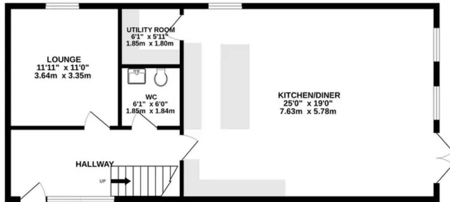
GROUND FLOOR 799 sq.ft. (74.2 sq.m.) approx.