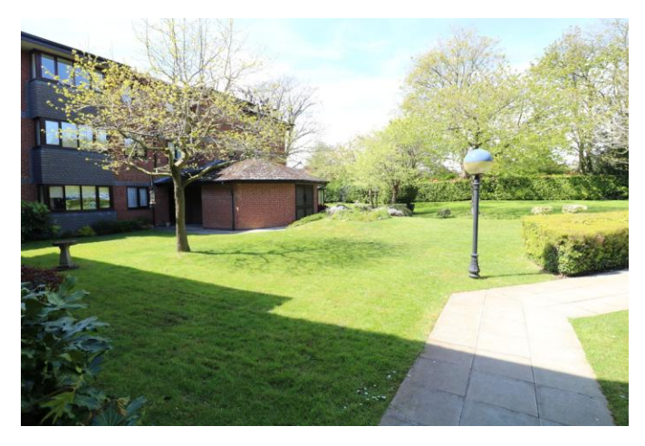
Length of Lease: 96 years (from 2024)