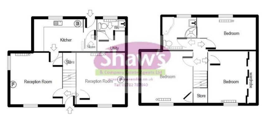
Whilst every attempt has been made to ensure the accuracy of the floor plan contained here, measurements of doors, windows, rooms and any other items are approximate and no responsibility is taken for any error, omission, or mis-statement and the floor plan is an illustration only as a guide. This plan is for illustrative purposes only and should be used as such by any prospective purchaser or tert enant. The services, systems, appliances, shown have not been tested and no guarantee as to their operation or efficiency can be given. Made with Visual Builder