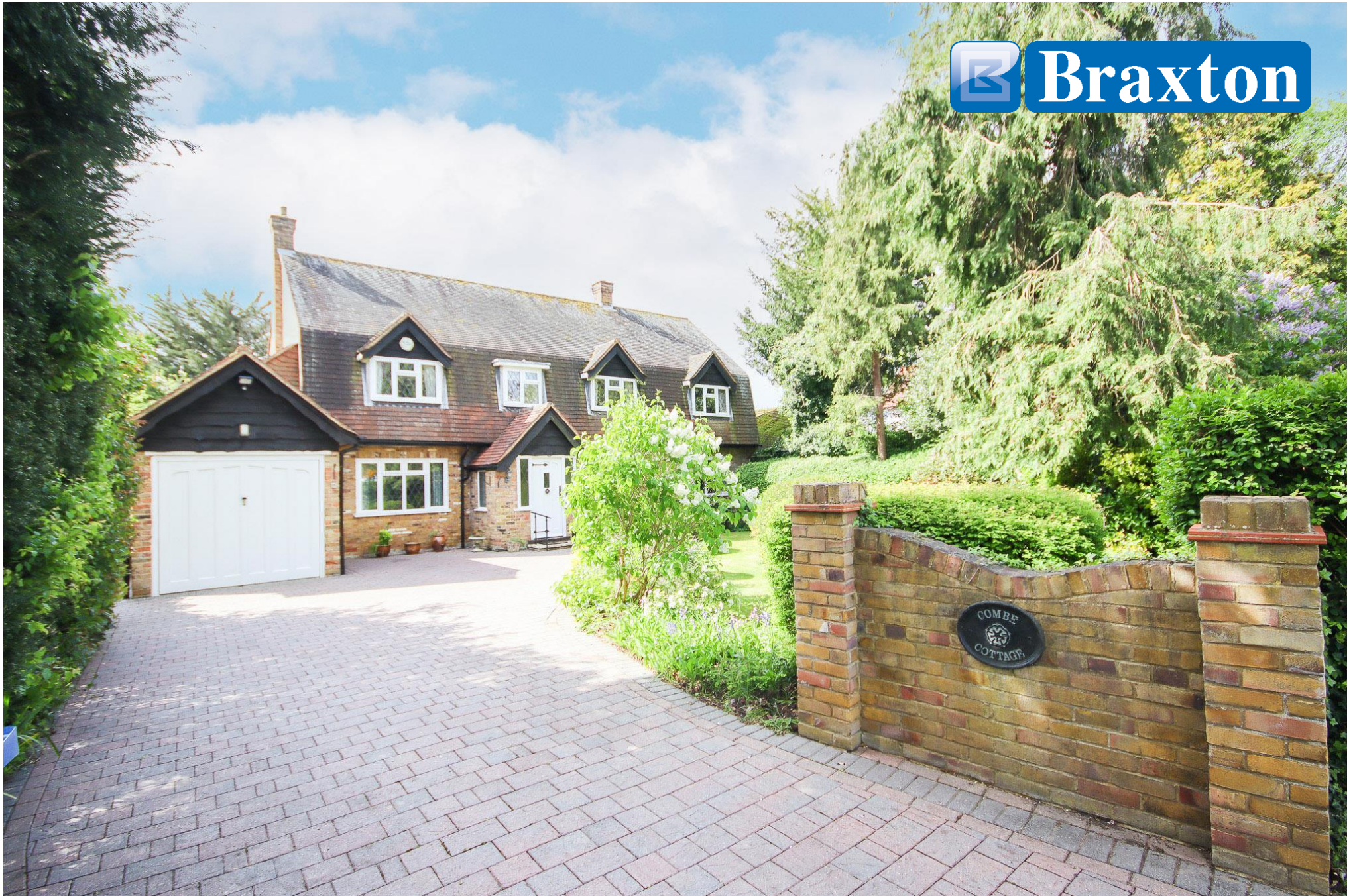
Combe Cottage, 71 Altwood Road, Maidenhead, Berkshire SL6 4PS