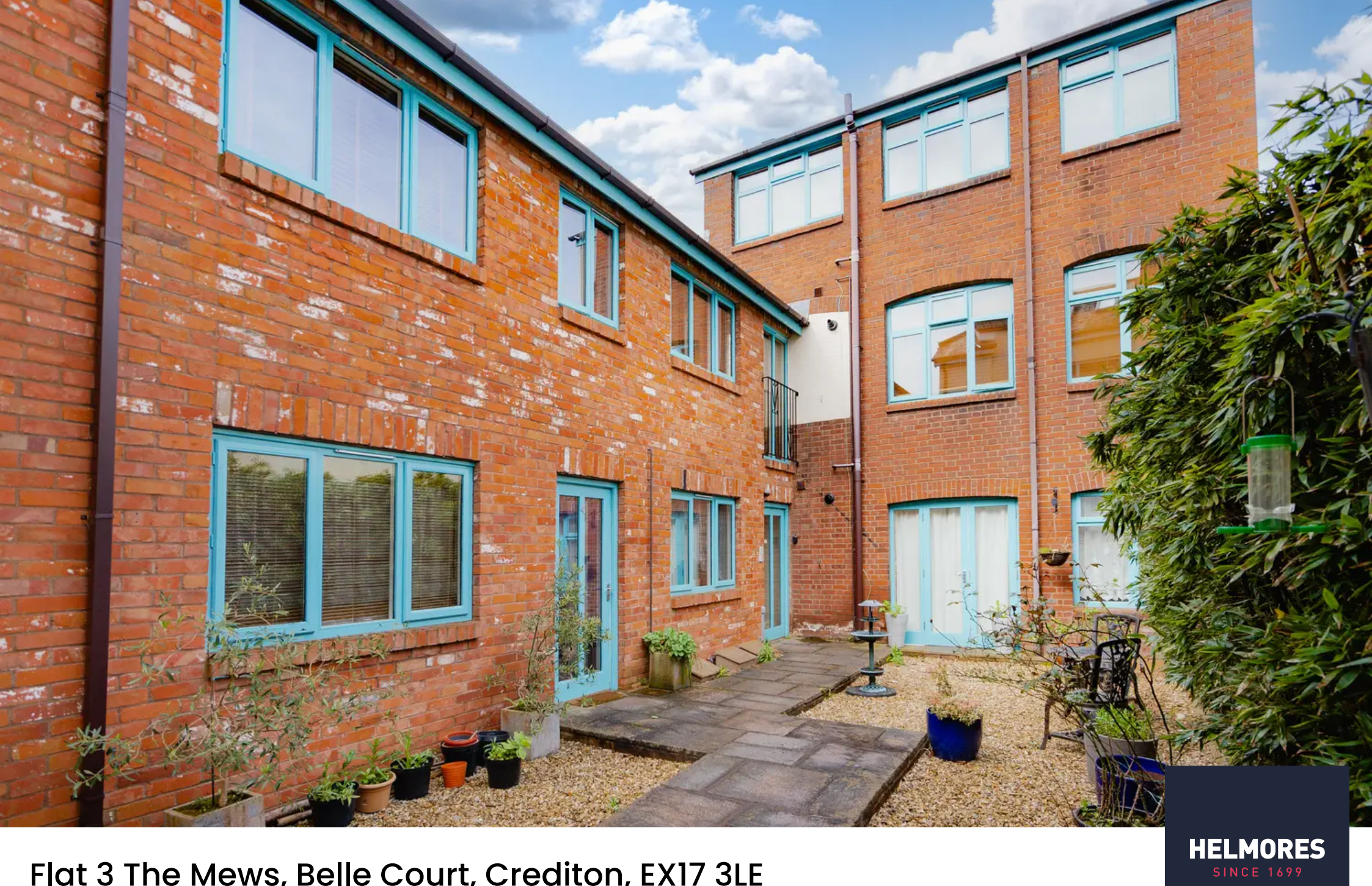
Flat 3 The Mews, Belle Court, Crediton, EX17 3LE