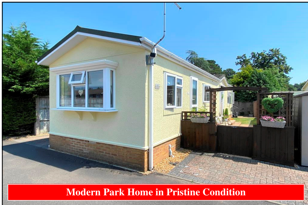
Modern Park Home in Pristine Condition

1c Pinehurst Park, West Moors, Dorset. BH22 0BW