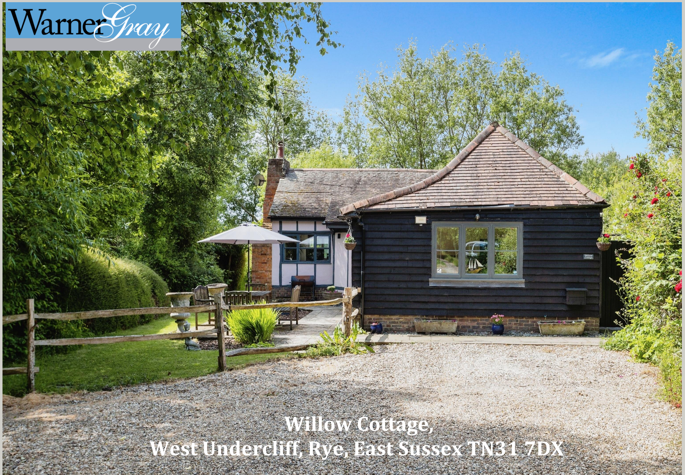
Willow Cottage, West Undercliff, Rye, East Sussex TN31 7DX