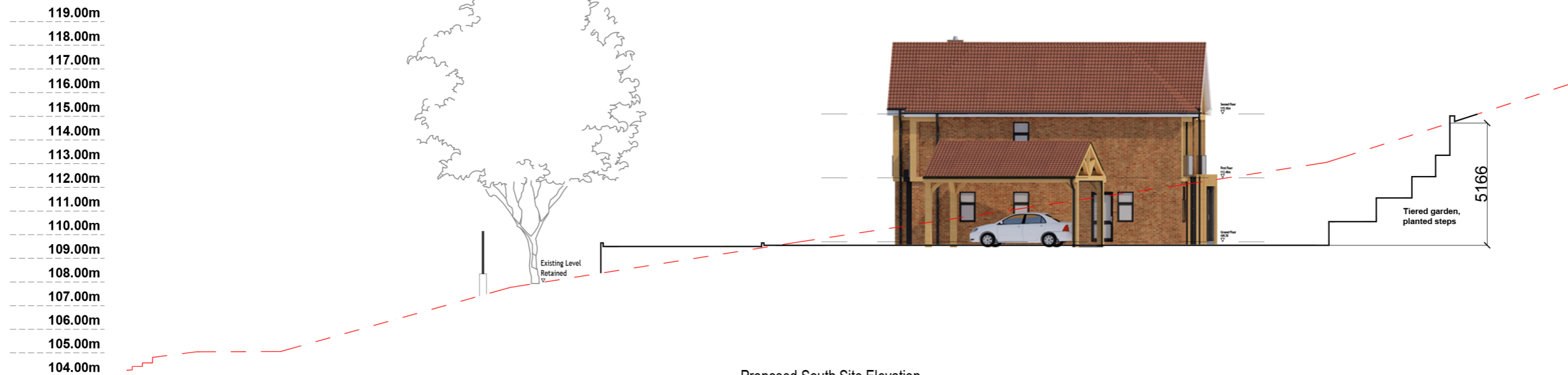
Proposed South Site Elevation Section A-A - Extract Scale 1:200 @ A3