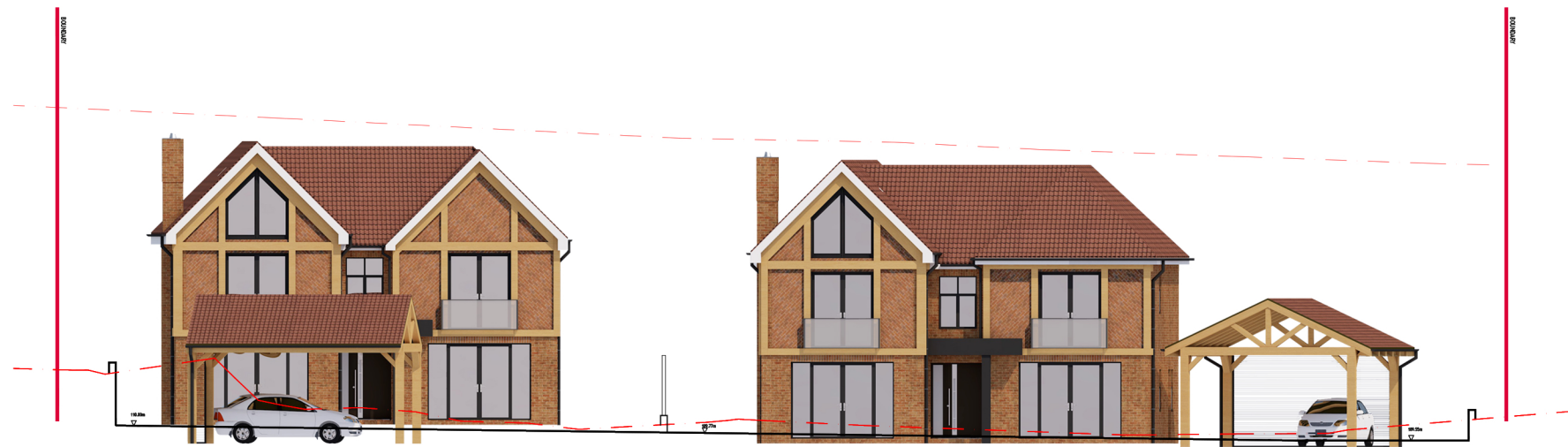
Proposed West Site Elevation Section C-C Scale 1:200 @ A3