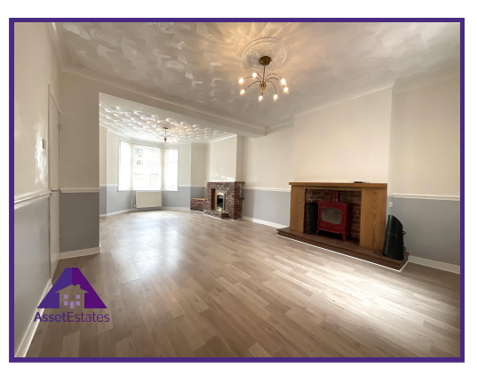
James Street, Abertillery, NP13 1AA