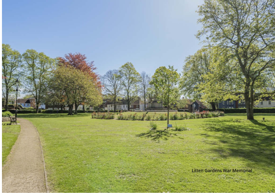
Litten Gardens War Memorial