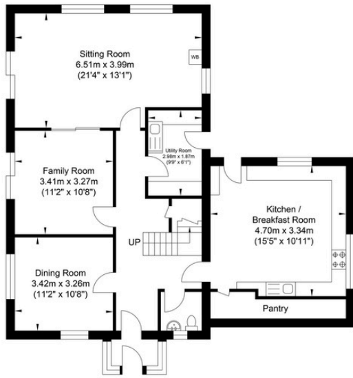
Ground Floor Approximate Floor Area 1043.77 sq ft (96.97 sq m)