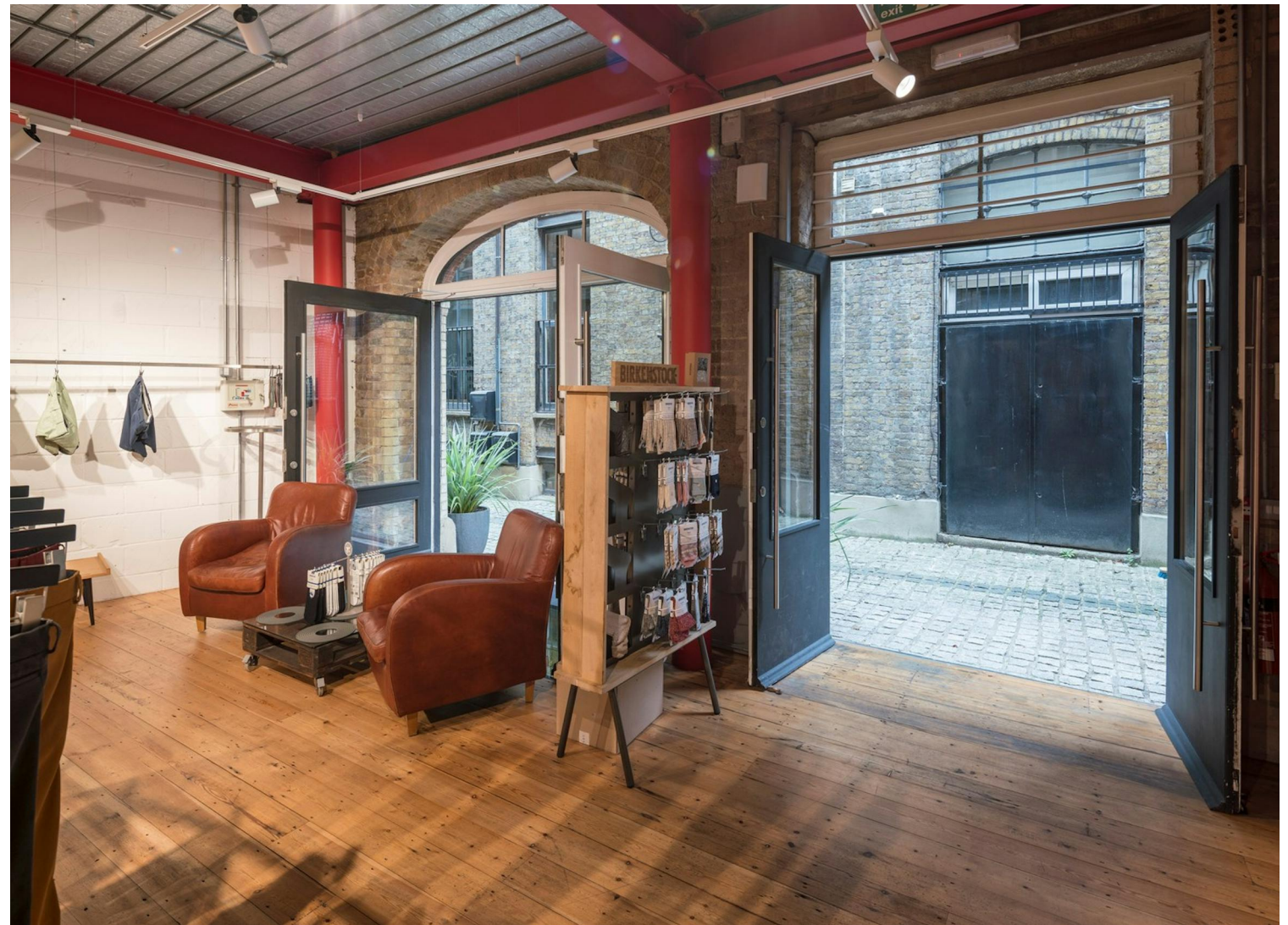
Entrance / Reception