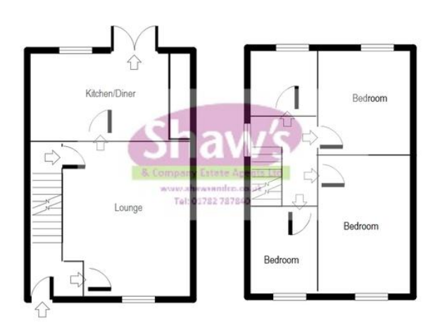
Whits every attempt has been made to enture the accuracy of the foor plan contained here, measurement of doors, windows, rooms and any other tems are approximate and no reprostrately its laken for any erro, mission, or mis stement and the foot plan is an illustration only as a guide. This plan is for illustrative purposes only and should be used as such by any prospective purchaser or temant. The services, systems, applications, shown have not been estated and no guarantee as to their operation or definency can be given.