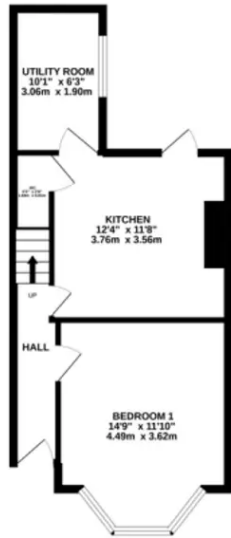
GROUND FLOOR 420 sq.ft. (39.0 sq.m.) approx.