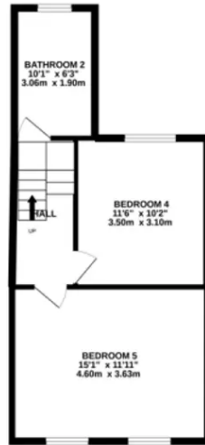
2ND FLOOR 414 sq.ft. (38.5 sq.m.) approx.