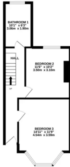
1ST FLOOR 419 sq.ft. (38.9 sq.m.) approx.