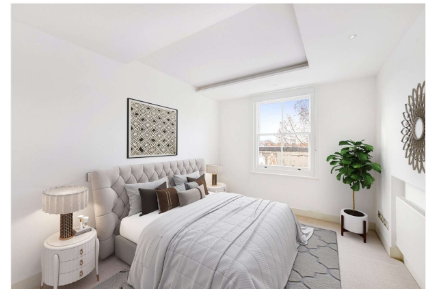
Photos and floorplan taken in 2022. Virtually staged.