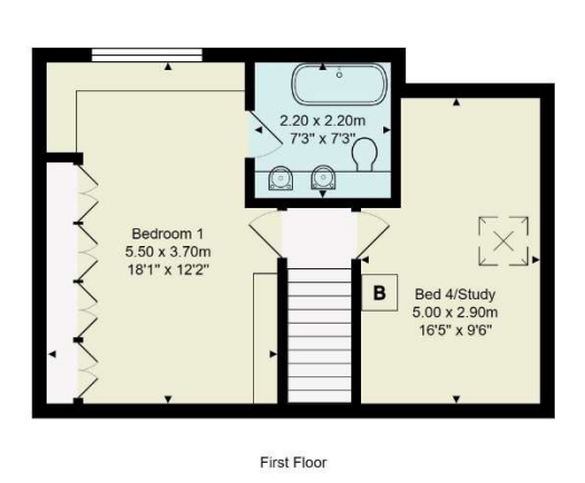
Total Area: 227.4 m² ... 2448 ft² All measurements are approximate and for display purposes only. Including garage