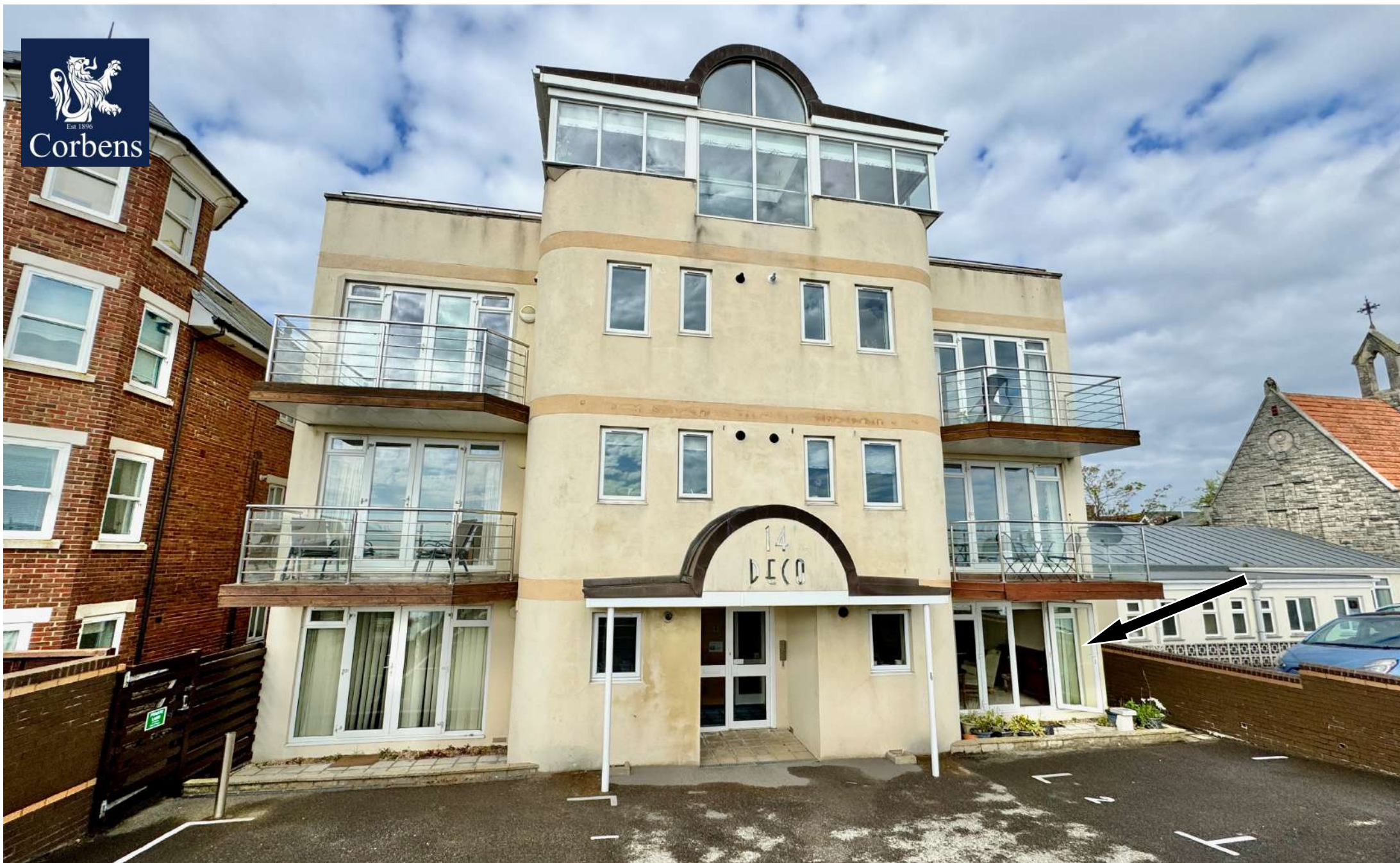
2 DECO, 14 REMPSTONE ROAD, SWANAGE £450,000 Shared Freehold