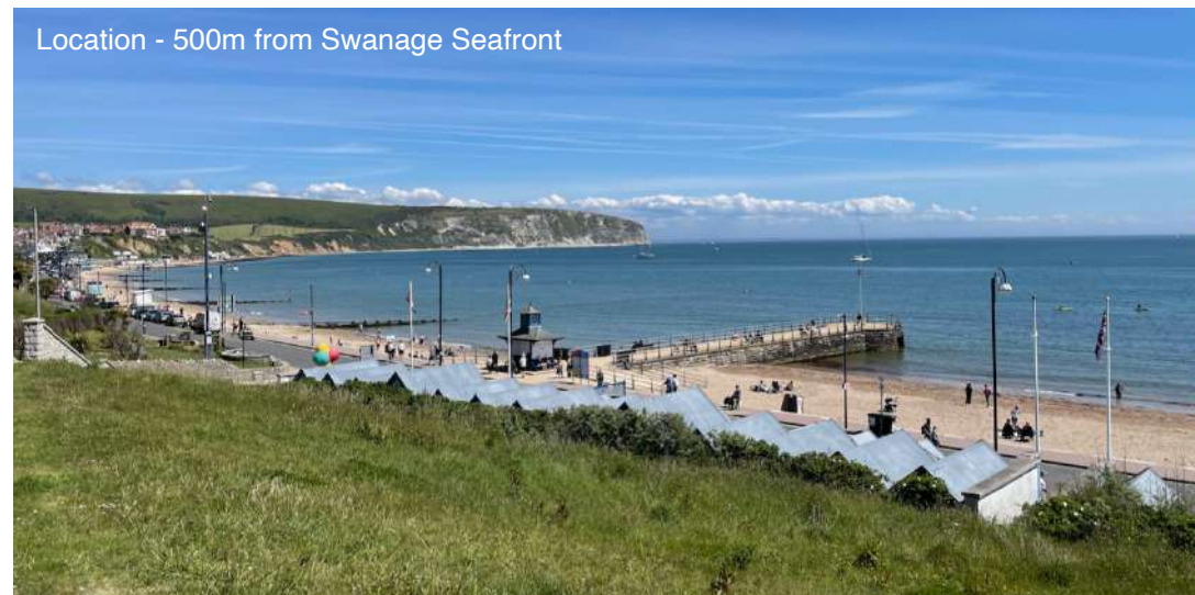
Location - 500m from Swanage Seafont

THE PROPERTY MISDESCRIPTION ACT 1991 You are advised to check the availability of this property before travelling any distance to view. The Agent has not tested any apparatus, equipment, fixtures and fittings or services and so cannot verify that they are in working order or fit for the purpose. References to the Tenure of a Property are based on information supplied by the Seller. The area of the building is given for guidance purposes only and must be verified by the purchasers surveyor. A Buyer is advised to obtain verification of this information from their Solicitor and/or Surveyor. FLOOR PLANS The floor plans supplied are for guidance purposes only and should not be used for measuring. Small recesses, cupboards & sloping ceilings may not appear on the plans. LOCATION PLAN The location plans supplied are for identification purposes only and are reproduced from the Ordnance Survey Map with permission of the Controller of H.M. Stationery Office. Crown Copyright reserved.