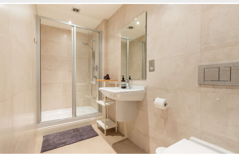
Bedroom Three En Suite

The family bathroom is a luxurious space in which to relax and offers high quality fittings including vanity wash hand basin, panelled bath with shower over, WC. Complementary tiling to walls, downlighters and extraction.