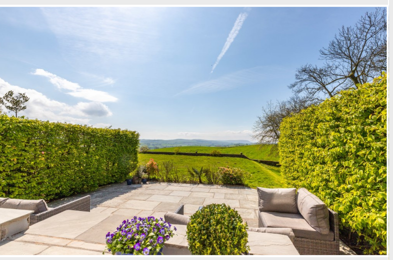
Rear patio and garden

Outside The property enjoys its own south facing patio area beyond the lounge which takes in the incredible far reaching views across the south lawn. Ideal for outdoor entertaining, a further communal courtyard patio can be enjoyed along with the 11 acres of parkland. Allocated parking is to be found directly to the front of the property and also in the parking bay adjacent to the garage (within a block nearby)