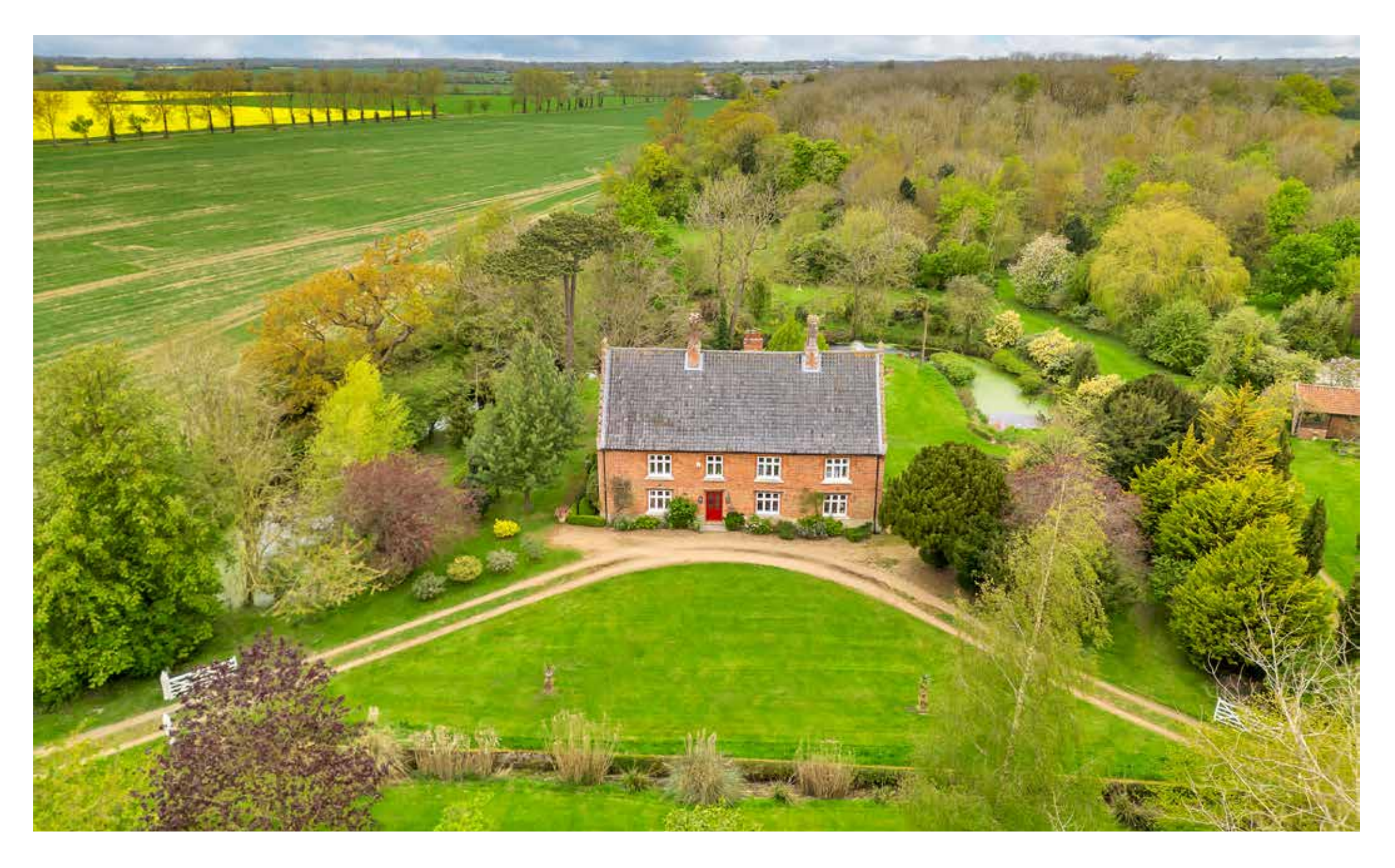
Starston Hall Hardwick Road | Starston | Norfolk | IP20 9PU