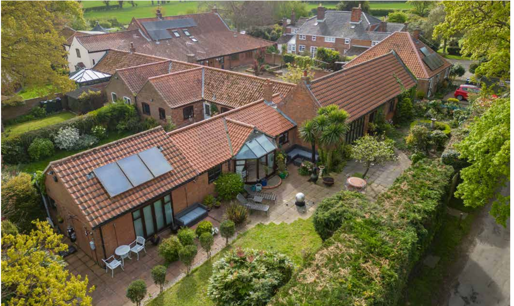
The Old Barn Back Lane | Rollesby | Norfolk | NR29 5EE