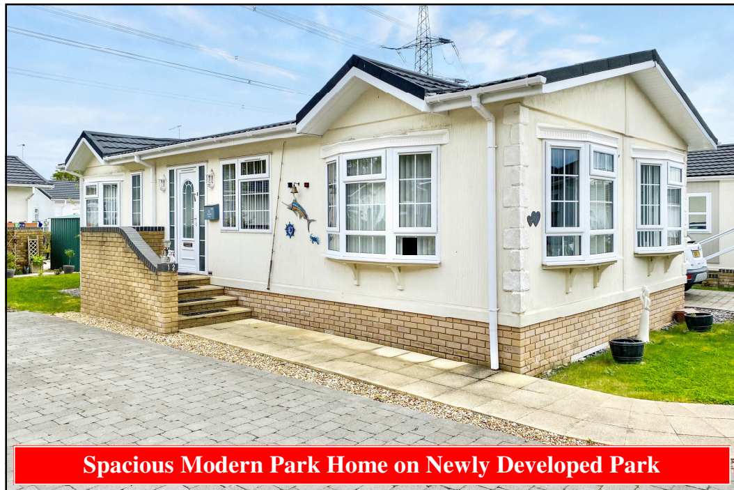
Spacious Modern Park Home on Newly Developed Park

12 Juniper Way, Deer's Court, Horton Road, Three Legged Cross, Wimborne. BH21 6FH