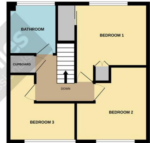
TOTAL FLOOR AREA : 88.0 sq.m. (948 sq.ft.) approx.

Whilst every attempt has been made to ensure the accuracy of the floorplan contained here, measurements of doors, windows, rooms and any other items are approximate and no responsibility is taken for any error, omission or mis-statement. This plan is for illustrative purposes only and should be used as such by any prospective purchaser. The services, systems and appliances shown have not been tested and no guarantee as to their operability or efficiency can be given. Made with Metropix ©2024