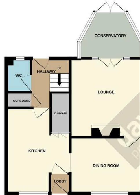
GROUND FLOOR 46.5 sq.m. (501 sq.ft.) approx.